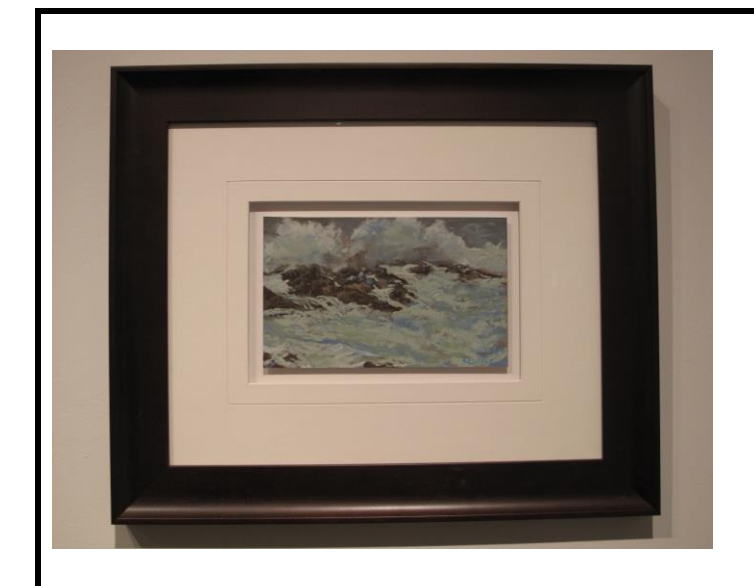
Honourable Mention Cathy Cullis Incoming Pastel