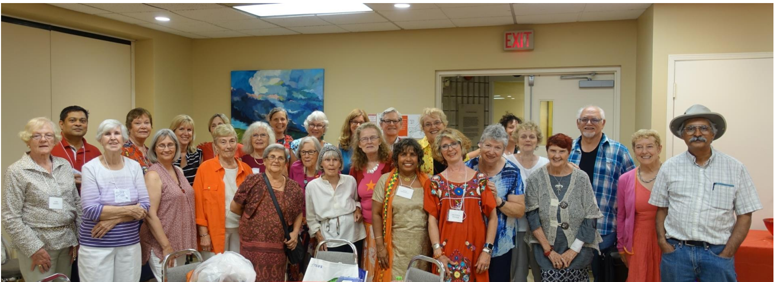
Group photo from the BFAA 50 th anniversary potluck dinner on June 21, 2016