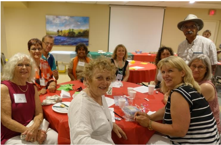
Art quiz winner at the BFAA 50 th anniversary potluck