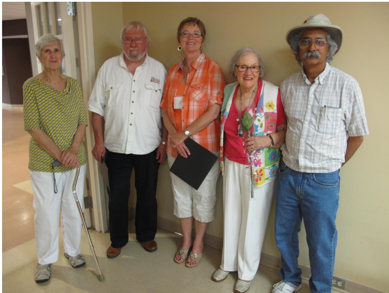
Pictured above: Left to Right