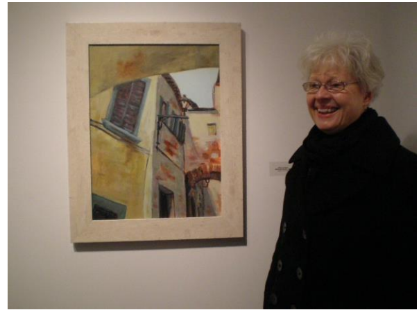
BFAA Juried Show