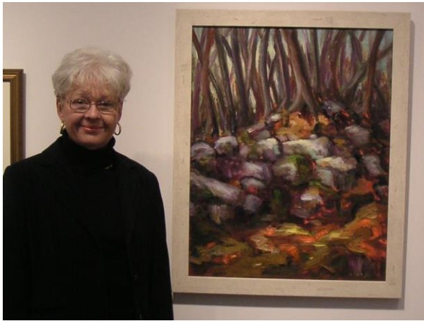
BFAA Juried Snow 2005 (Judges Choice)