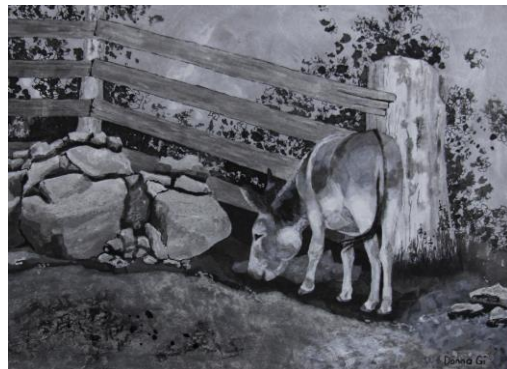
Donkey by the rock pile